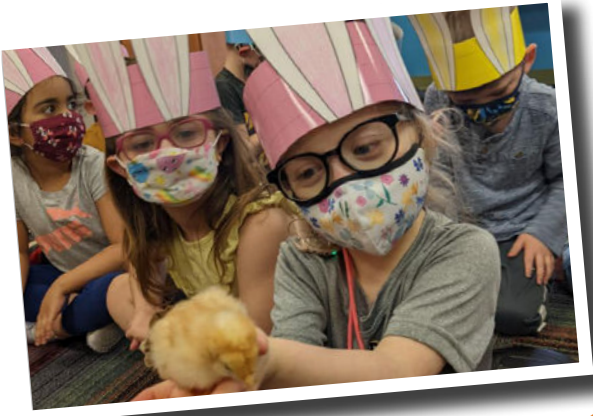
As a special Easter surprise, our students were treated to a visit from some very special animals! One of our parents brought in baby chicks and bunnies for students to pet and hold!