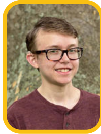
TALON ACLD Tillotson School