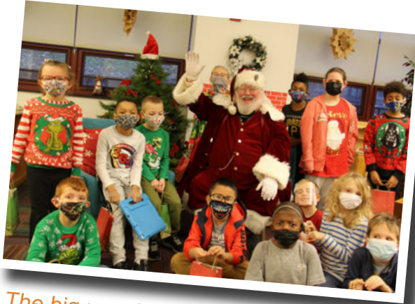
The big man himself, Santa Claus, made a very special visit to DePaul School to listen to our students' Christmas wish lists and sing some carols together! The oldest students asked Santa all of their burning questions about his magical life.