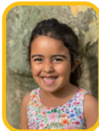
SENNA Moon Area School District