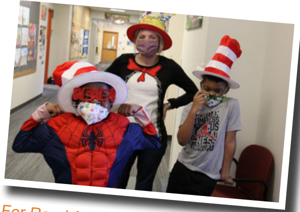
For Read Across America Day, students and staff dressed up as their favorite literary characters and got to have a "lights out, read out" party! Each student had their own flashlight to read with!