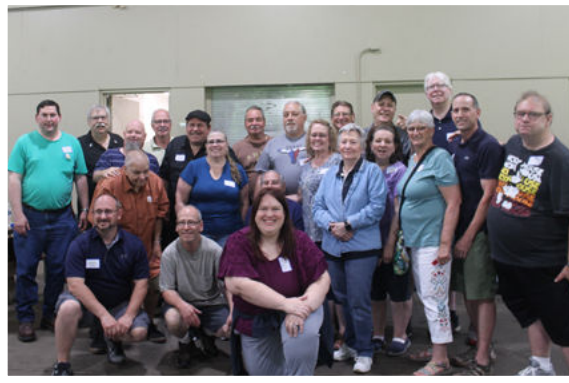
We were so excited to see more than 150 alumni, families, and students at our Annual Picnic at Schenley Park in June!