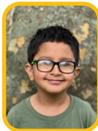
PRIYAS Pittsburgh Public School District