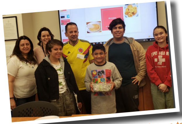
In Spanish Club, students had a chance to not only practice their Spanish language skills, but also to experience different cultures and food! Members of the Columbian community visited with some special foods and drinks from their country.