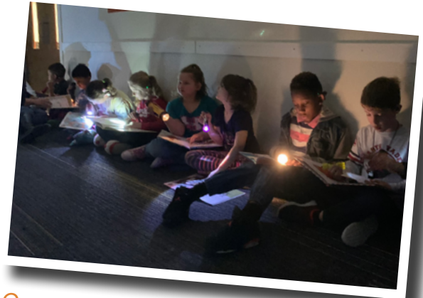
Our school year's focus was on reading. One of our favorite activities was our "Lights Out, Read Out" party. We turned out the lights in the hallway and all read our favorite books by flashlight!