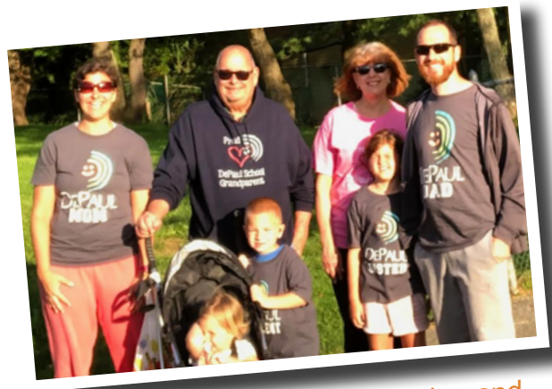
DePaul Families were Listening and Speaking Rockstars at the virtual Highmark Walk for a Healthy Community , walking around their neighborhoods and raising money for DePaul!!