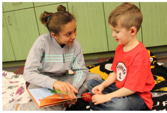
To celebrate reading, students wished Dr. Seuss a happy birthday with a huge reading themed picnic for Read Across America day!