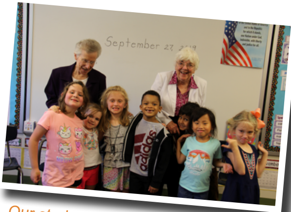
Our students were delighted to host the Sisters of Charity of Seton Hill for our annual Founders' Day Celebration!